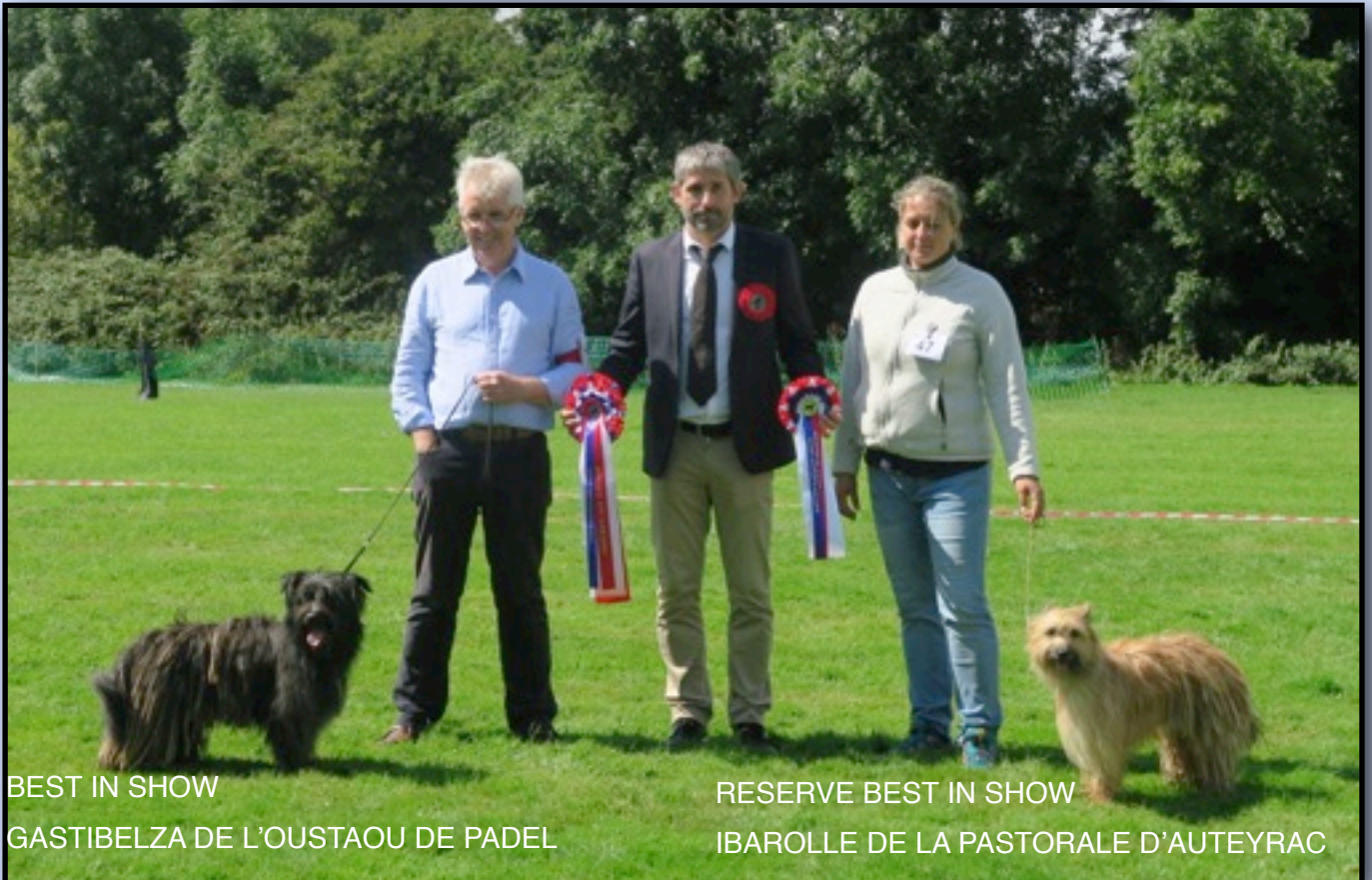
BEST IN SHOW GASTIBELZA DE L'OUSTAOU DE PADEL