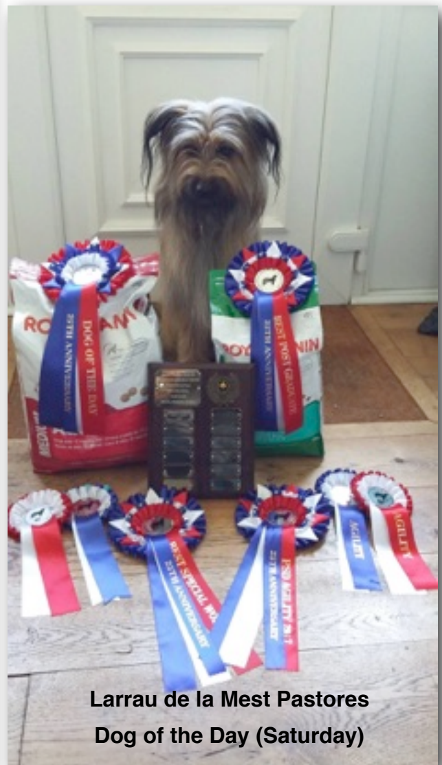
Larrau de la Mest Pastores Dog of the Day (Saturday)