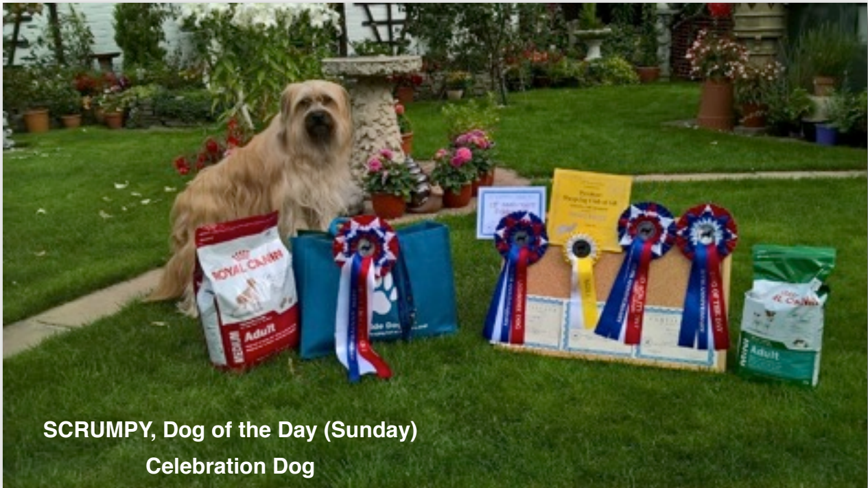
SCRUMPY, Dog of the Day (Sunday) Celebration Dog