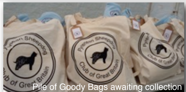
Pile of Goody Bags awaiting collection