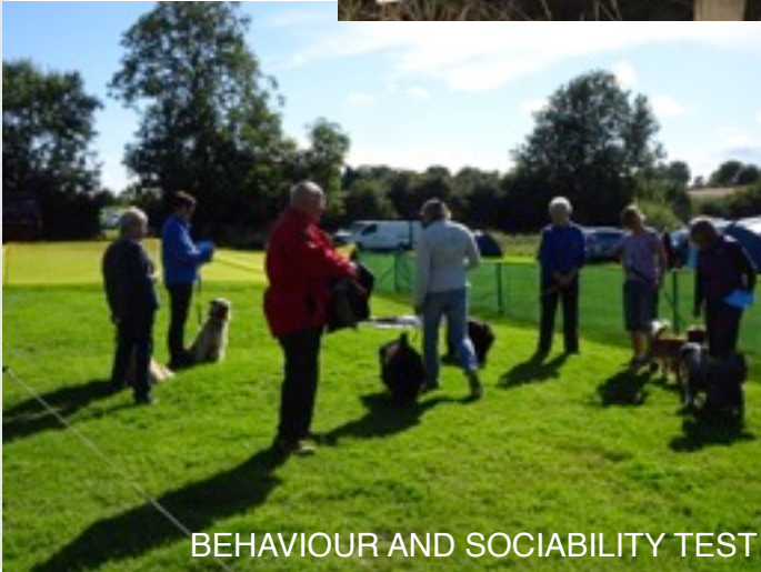
BEHAVIOUR AND SOCIABILITY TEST