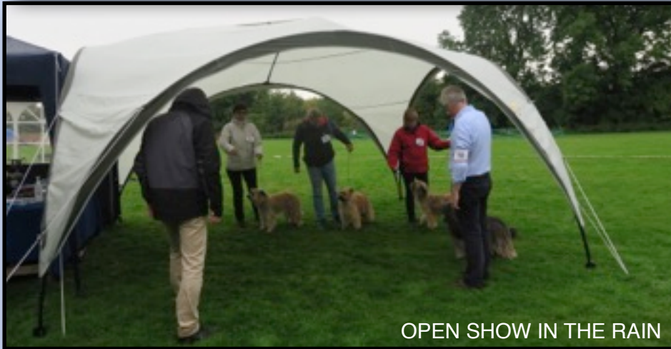
OPEN SHOW IN THE RAIN