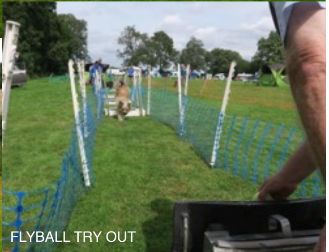
FLYBALL TRY OUT

Additional activities ongoing during the weekend