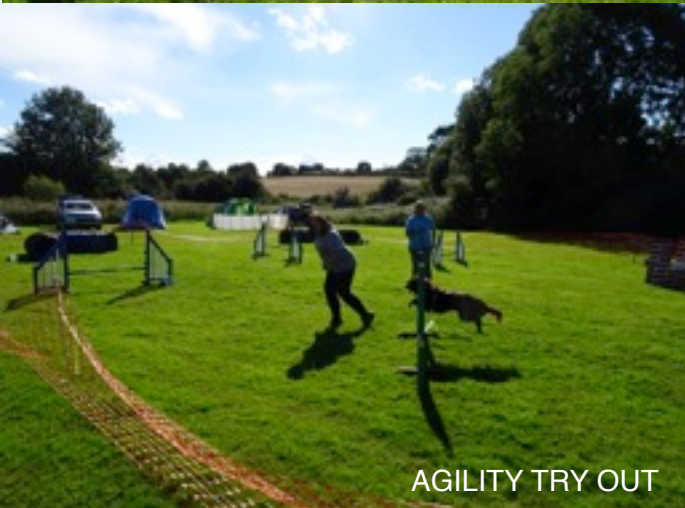
AGILITY TRY OUT