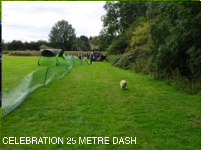
CELEBRATION 25 METRE DASH