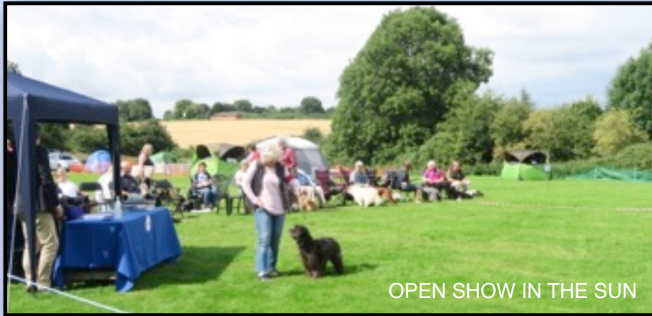
OPEN SHOW IN THE SUN