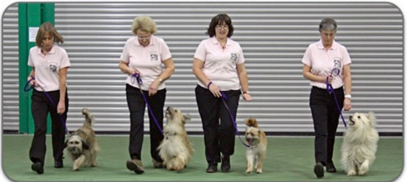
PSD Club of GB Obreedience Team strut their stuff at the auditions for a place at Crufts 2015