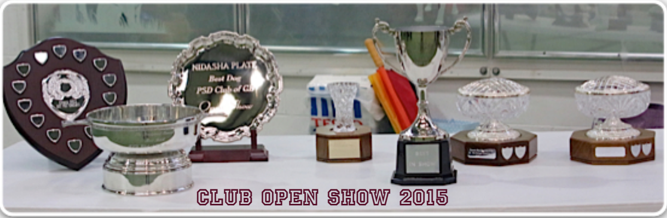
CLUB OPEN SHOW 2015