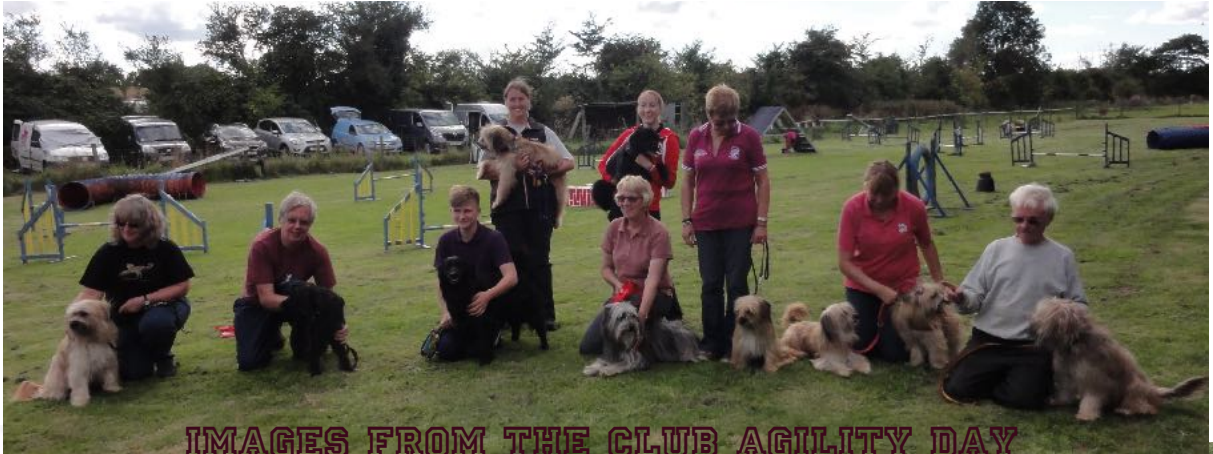
IMAGES FROM THE CLUB AGILITY DAY