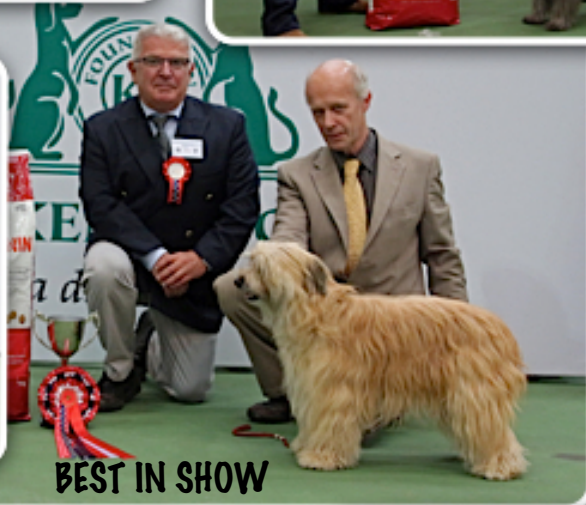
BEST IN SHOW