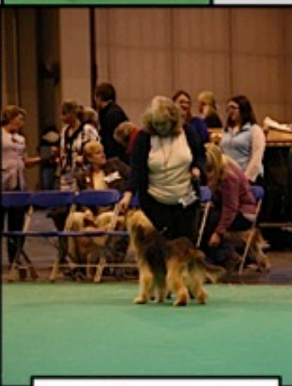
KIMRAND BONNE AMIIE