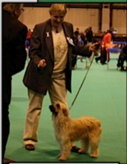
SEACOURT ESPRIT DU VENT FOR THYMEWINDS