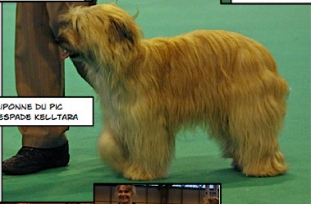
FRIPONNE DU PIC D'ESPADE KELLTARA