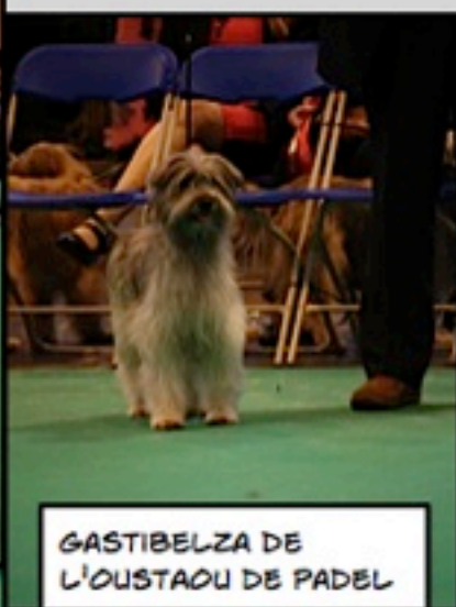
GASTIBELZA DE L'OUSTAOU DE PADEL