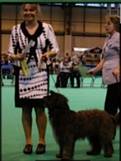
IVYDALE CHOIRBOY MESABRIT