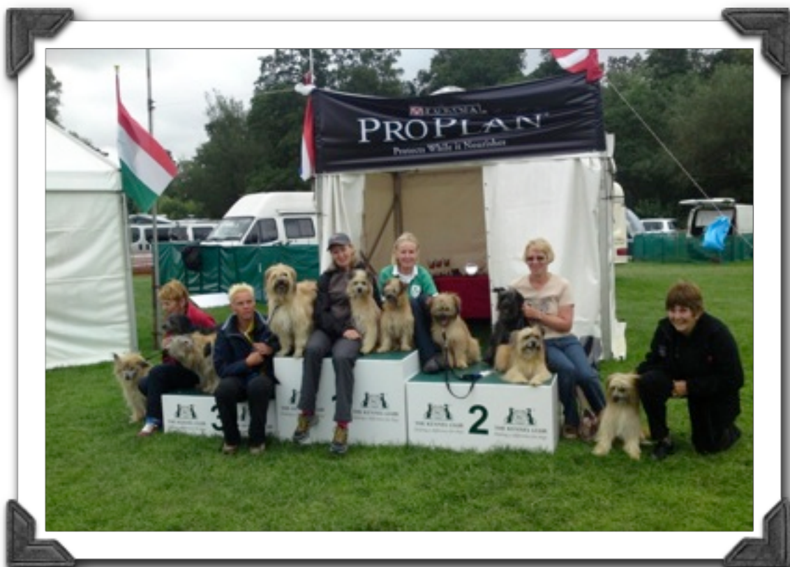
From Left to Right: Ollie, Tag, Coco, Zen, Daena, Tiggy, Bobby, Meg, Ria, Asti and their owners.