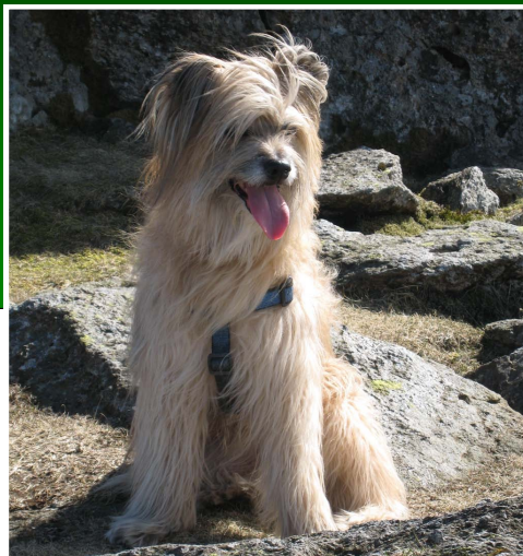
The Pyrenean Sheepdog Club of Great Britain Berger des Pyrénées