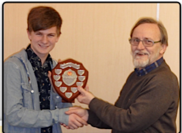
First Place Agility Points