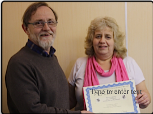
Third Place Showing Points